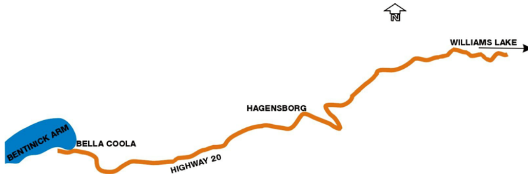
Figure 1. Hagensborg Location Plan

Hagensborg is located on Highway #20, approximately 15 kilometers east of Bella Coola as shown in Figure 1 below.